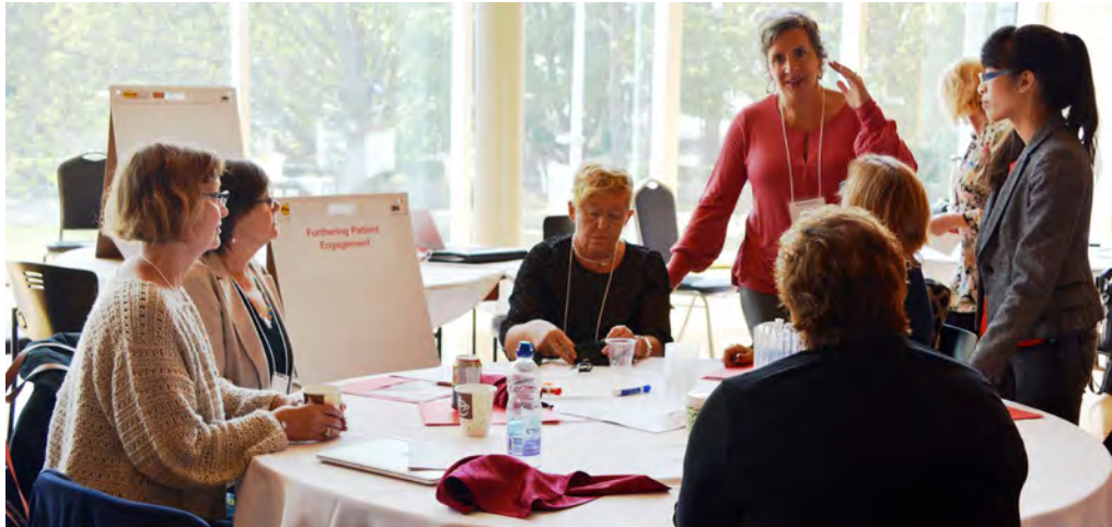
Discussing how to further Patient Engagement at the Chronic Pain Network's Inaugural Annual Meeting, held in Hamilton in 2017.

In the beginning, the idea of patient engagement (PE) in research was new. There were some growing pains in its evolution. Today, PE is included in the development of research questions and on grant applications. Patients are included on research planning committees and projects require detailed PE plans throughout the entire project and beyond. As the Strategy for Patient Oriented Research became best practice, it was clear that researchers and patients exist in mutual symbiosis where their success is tied to one another.